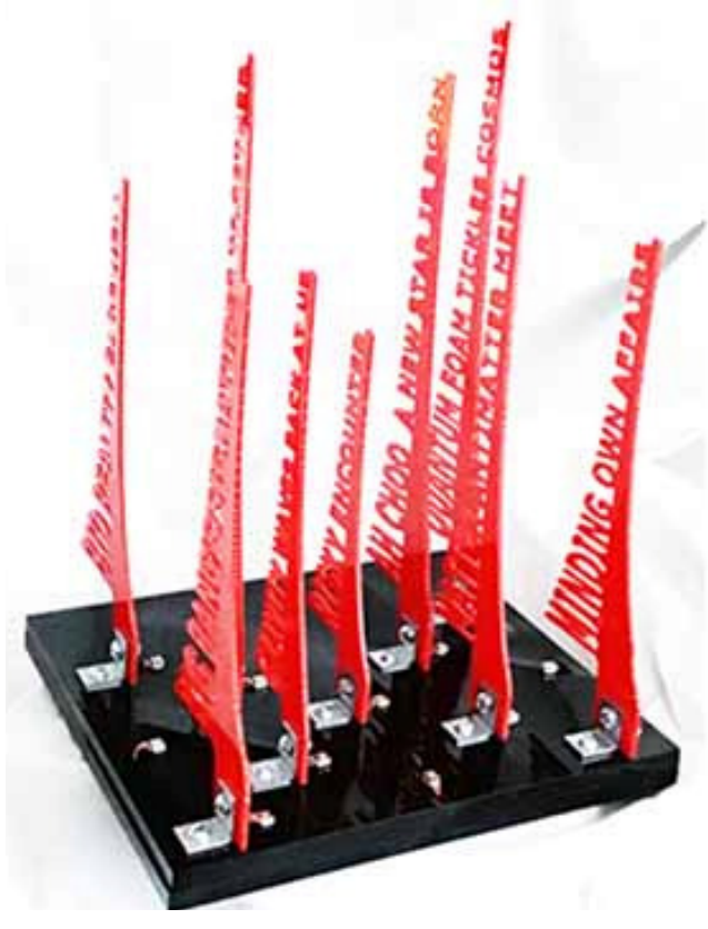
Figure 3. Sagittarius A X1 (Twotanka in an X shape arrangement share the middle line)

Figure 4 contrasts the text that we can read with the binary code that a computer can read. The actual lines of the haiku "Bits to Memes" are: on page 1 "as bits change to bytes", on page 2 "base 2 shines revealing