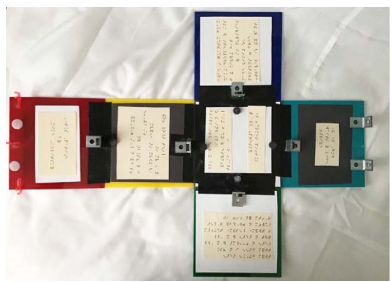
Figure 5b. Cube of Poetry (showing Braille inside when open)